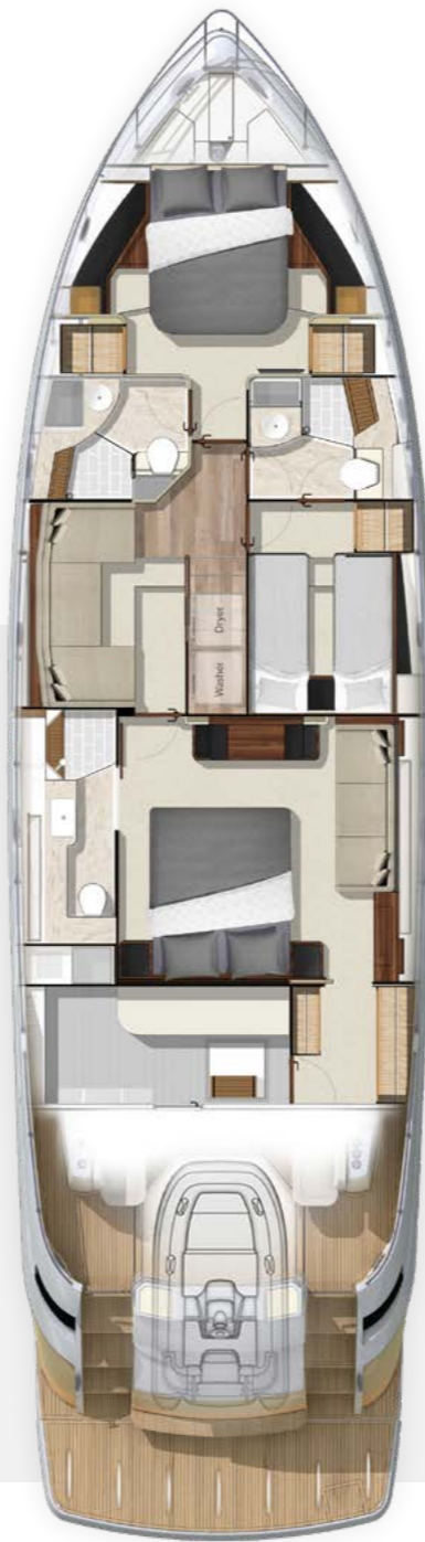
ACCOMMODATION DECK Shown with optional lower lounge design