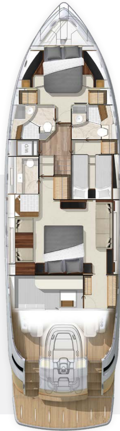
ACCOMMODATION DECK Shown with optional Presidential design